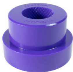
Polyurethane A Bush