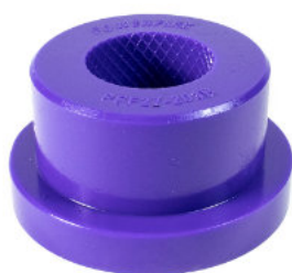
Polyurethane B Bush